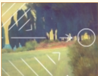
5 Value and Color Shapes