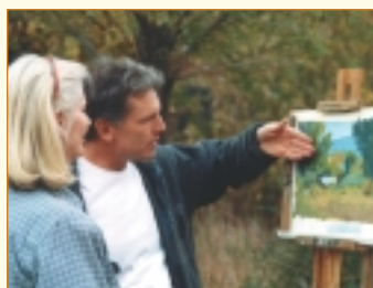
6 Workshop Critiques