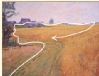
3 How the Eye Moves on the Picture Plane