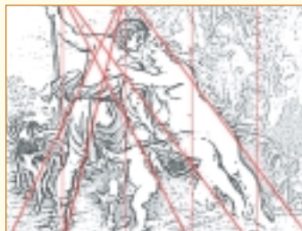
2 The Need for an Armature